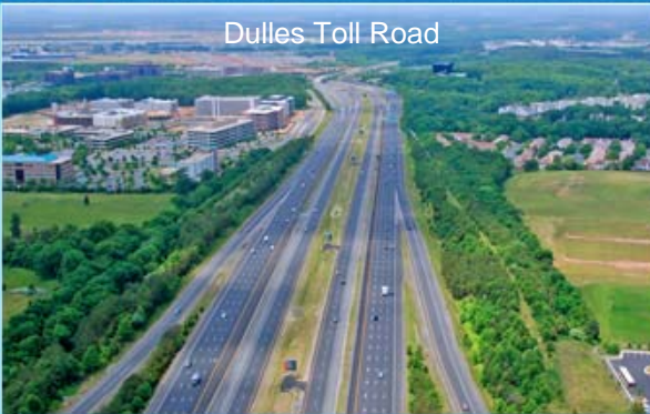
Dulles Toll Road