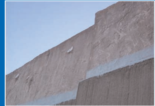
Existing Sound Walls